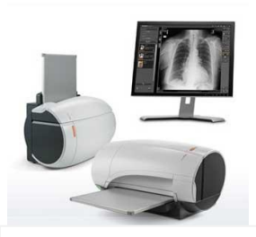
Vita Flex CR (X-Ray Digitizer)

The Classic CR System is customized to streamline workflow for higher productivity and patient throughput. It is enabled to print Digital X-ray and Mammography images.