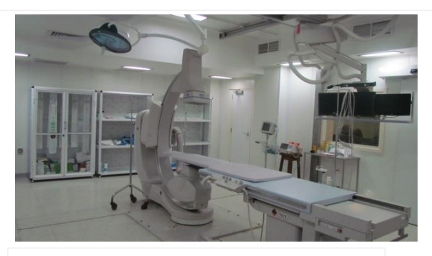
Toshiba Infinix- I Cathlab Suite, University College Hospital, UCH Ibadan