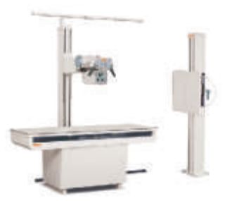
Ascend Ceiling mounted X-ray