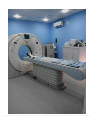
Toshiba Aquilion Prime 160-slice CT, Aminu Kano Teaching Hospital, AKTH Kano