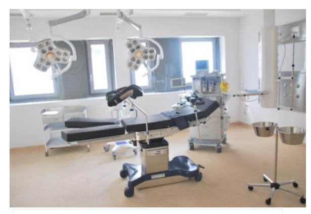
Operating Theatre suite, Ibom Specialist Hospital, Uyo, Akwa Ibom State