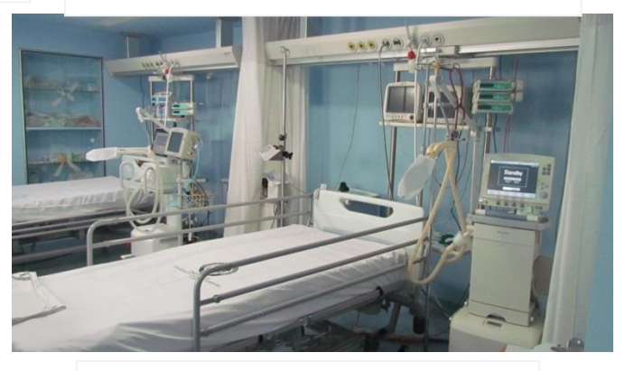
ICU at University College Hospital, UCH Ibadan