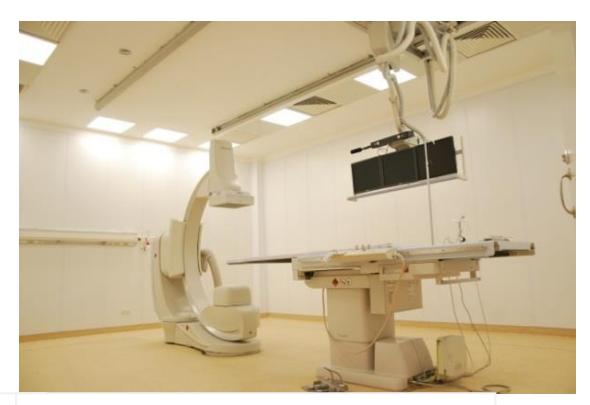
Toshiba Infinix- I Cathlab Suite, Ibom Specialist Hospital, Uyo

Toshiba Aquilion One ™ 640- Slice CT, Ibom Specialist Hospital, Uyo