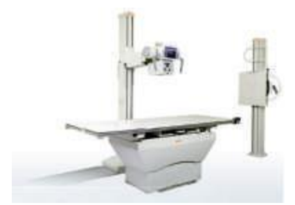
Ascend Floor mounted X-ray

Carestream's Ascend™ floor-mounted X-Ray system is ideal for busy Radiology Departments or specialized Orthopaedic practices. It comes with a range of Bucky table options of a freestanding tube stand that eliminates the cost and time involved in installing ceiling mounted rails, and can also be used in facilities that cannot support a ceiling-mounted system. The 500KW, 3 PHASE ODYSSEY™ generator option is designed to minimize radiation dose and exposure time while maximizing image quality. Automated control settings allow users to select various imaging parameters quickly, and software options ensure the per-patient examination time is reduced to maximize patient throughput.