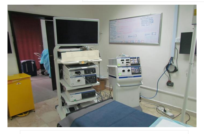
Endoscopy suite, Southshore Women's Clinic, Lagos