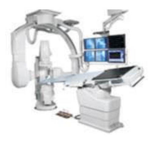
Ceiling mounted Cathlab

Toshiba have worked hand-in-hand with leading clinicians to develop a Cathlab range called Infinix-i ™ range (" Best in Klas" Award winner 2014 ), which comes in Hybrid, single or dual plane, floor or ceiling mounted variations, with more cardiac and vascular/periphery options to meet the varied access, coverage and workflow demands of the modern Cardiology Department without compromising on image quality.