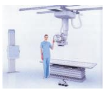
Radrex Ceiling Mounted X-ray