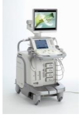
Aplio 300 with Echo Micropure options