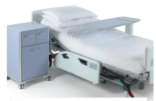
Hospital Ward with Enterprise CR5000 Bed, Overbed Table and Bedside Locker