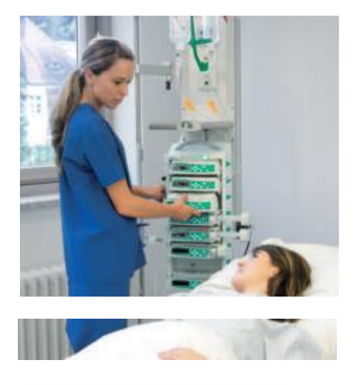
Infusomat Space, Pefusor Space & Space Station