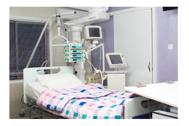
ICU at Paelon Hospital, Lagos