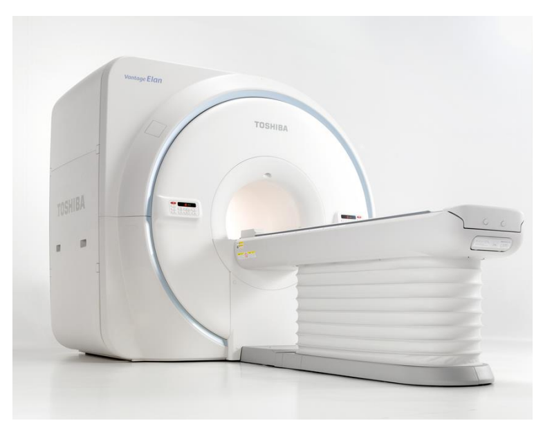
Toshiba Vantage Elan 1.5 Tesla MRI

Moreover, the Vantage systems are the only systems available with a complete suite of contrast-free MRI Angiography (MRA) technologies, which works well for diabetic patients or those with renal insufficiency who are not suited to standard MRI techniques. This is also useful for the Nigerian market where getting good quality reagents in a timely manner may be difficult and affordability cannot be guaranteed.