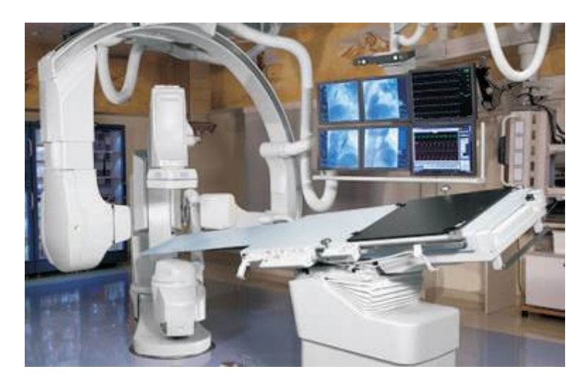
Infinix-I Hybrid Catheterization Suite

With our experience of building and equipping worlds-class cardiovascular centres in Nigeria, JNCI are the experts you can trust to guide you through the range of Cathlab equipment and help you build the cardiovascular centre of your dreams. We have currently installed the Infinix-i Hybrid Catheterization Suite at the University College Hospital, Ibadan; Ibom Specialist Hospital, Uyo and Babcock University Teaching Hospital, Ilishan, Ogun State.