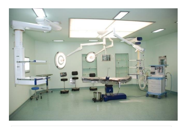
Operating Theatre Suite, University College Hospital, Ibadan