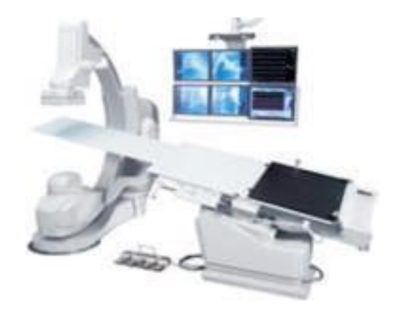
Floor mounted Hybrid Cathlab