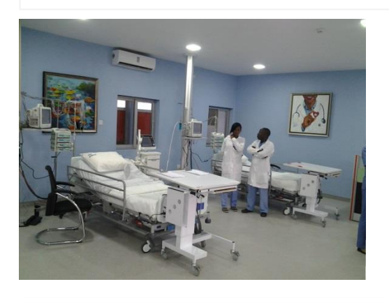
ICU at Babcock University Teaching Hospital, BUTH, Ilishan, Ogun State