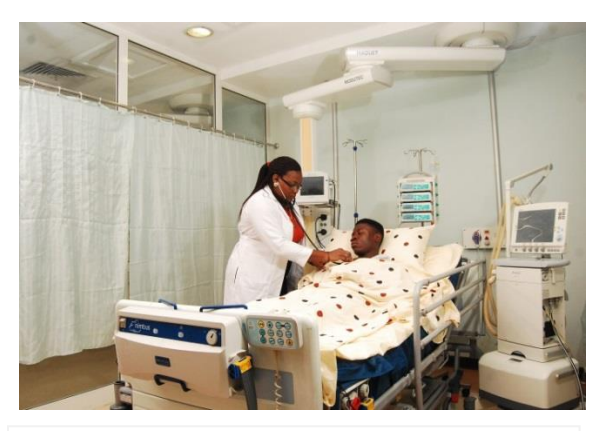
ICU at Lagoon Hospital, Apapa, Lagos