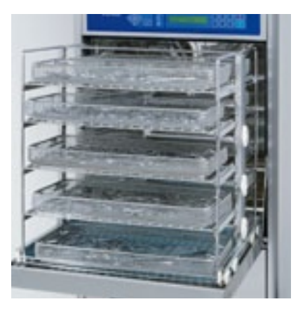
5-level instrument wash cart