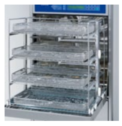
4-level instrument wash cart