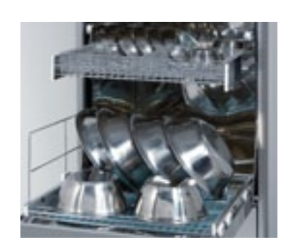
Getinge 46-2 – for wards and outpatient clinics, items on two levels.