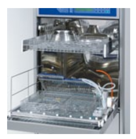
Universal lower wash cart and basic upper wash cart