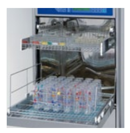
Baby feeding bottles