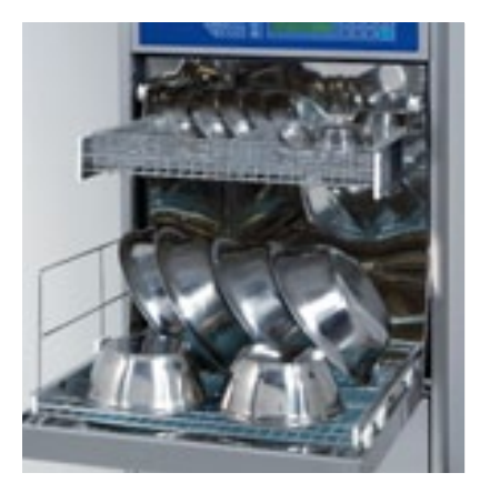
Bowls 2 levels