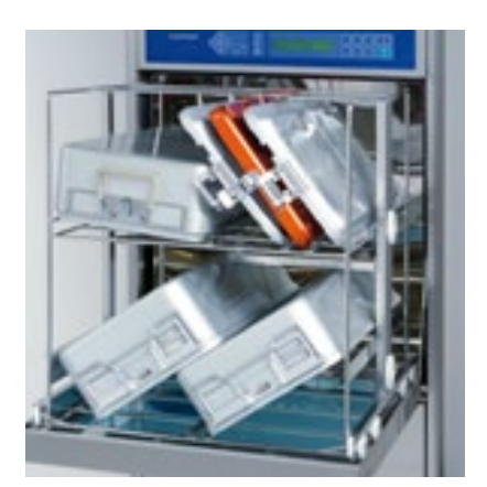
Container wash cart