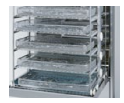
Getinge 46-5 – for larger surgical instrument sets and central sterile supply departments, items on five levels.