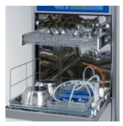
Lower wash cart with L-shaped injector bar