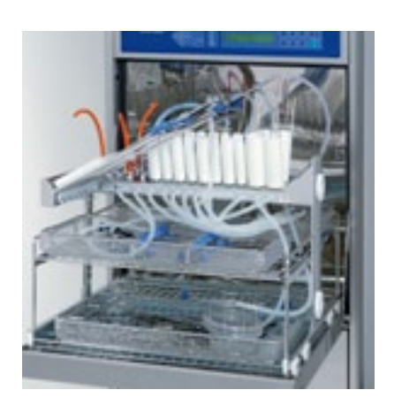
MIS wash cart