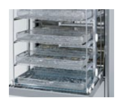
Getinge 46-4 – for surgical departments and smaller central sterile supply departments, items on four levels.