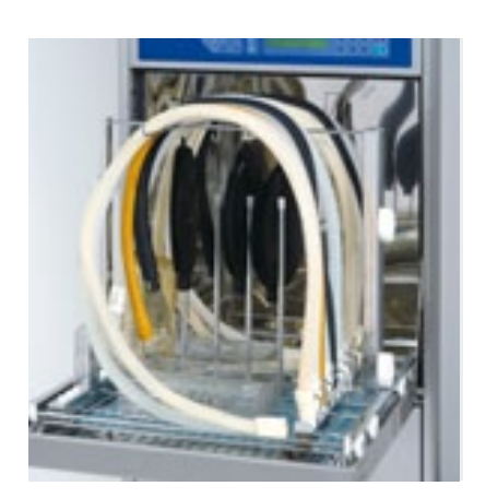
AN wash cart